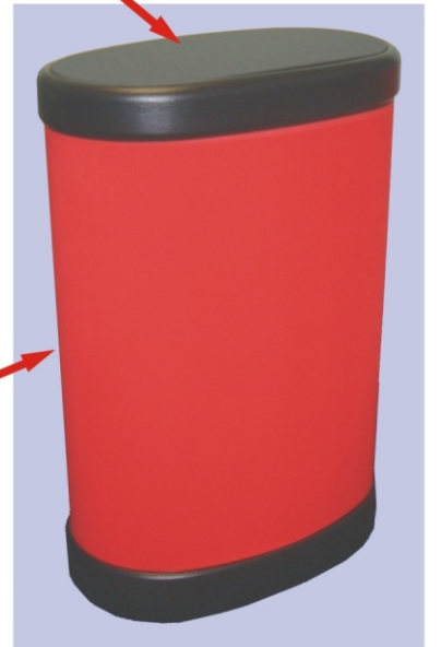
Fabric case to counter conversion

Optional case conversion wrap secured using hook fastener