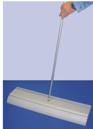
Assemble the bungee pole and insert into the base