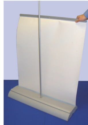
Lean the bannerstand backwards and extend each banner by lifting the top rail until the complete image is visible