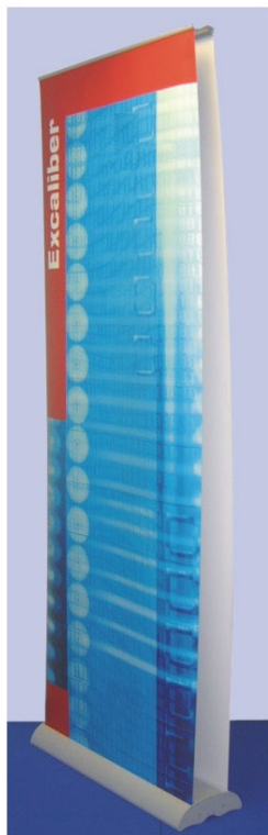
Assembled Excaliber 2