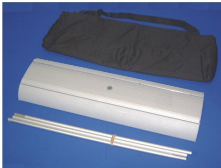
Kit includes : Base, bungee pole set, two top rails and carry bag